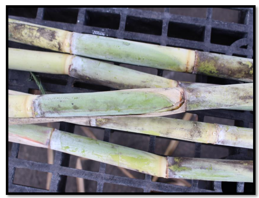
CP 09-4758 mature stalks