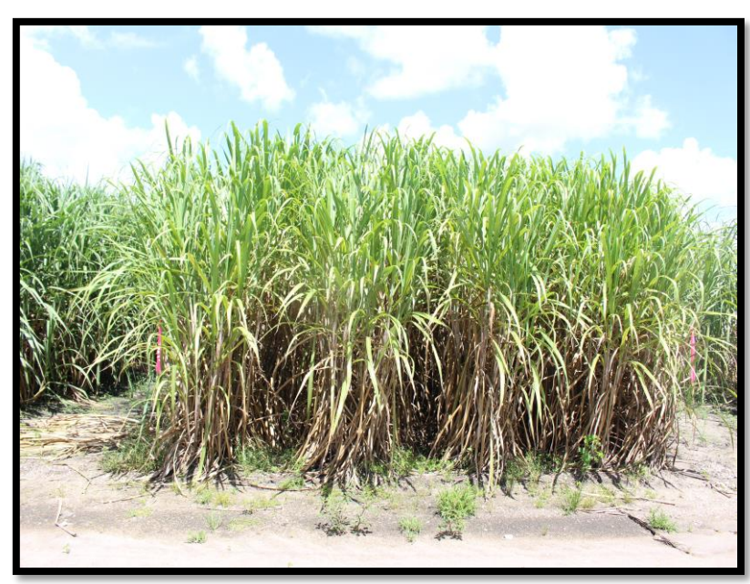
CP 09-4758 at late growth stage in sand soil