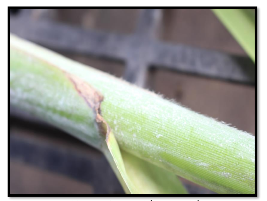
CP 09-47583 top with no auricles