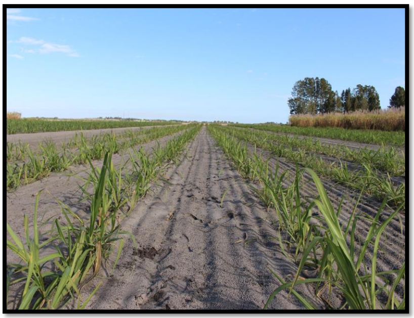
CP 09-4758 at early growth stage in sand soil