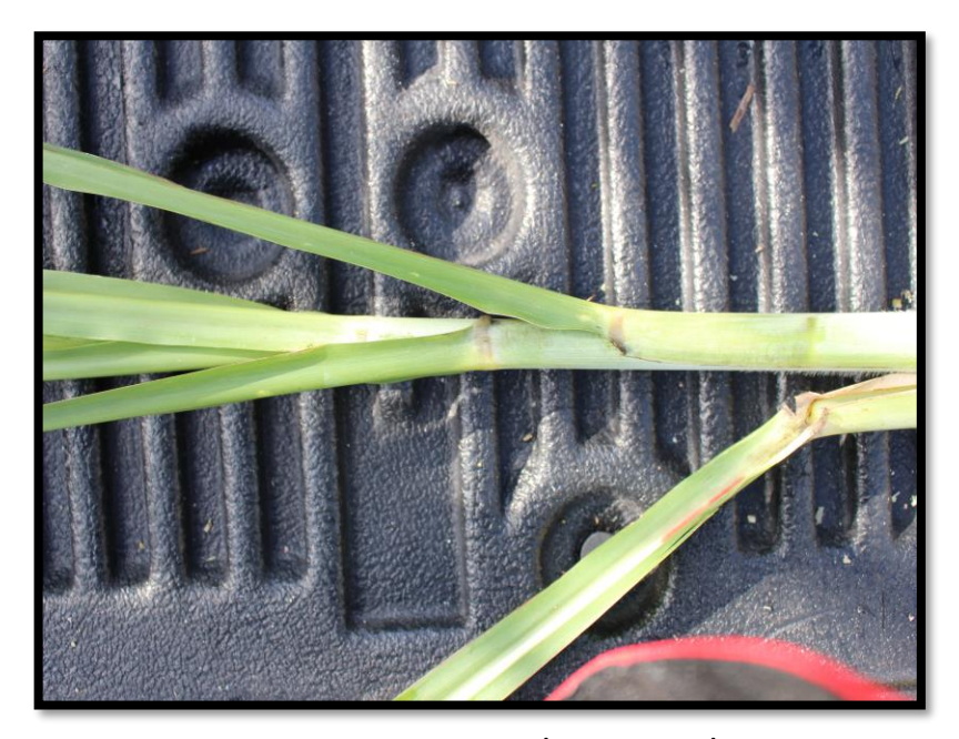
CP 06-2495 tops with no auricles