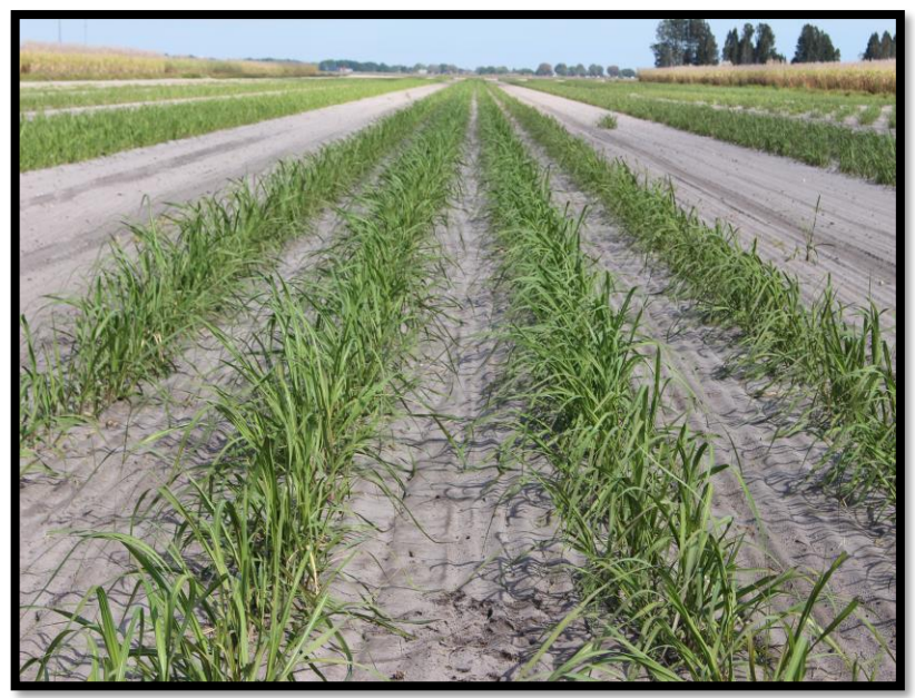
CP 06-2495 at early growth stage in sand soil