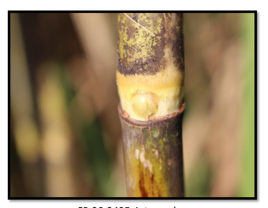
CP 06-2495 internodes