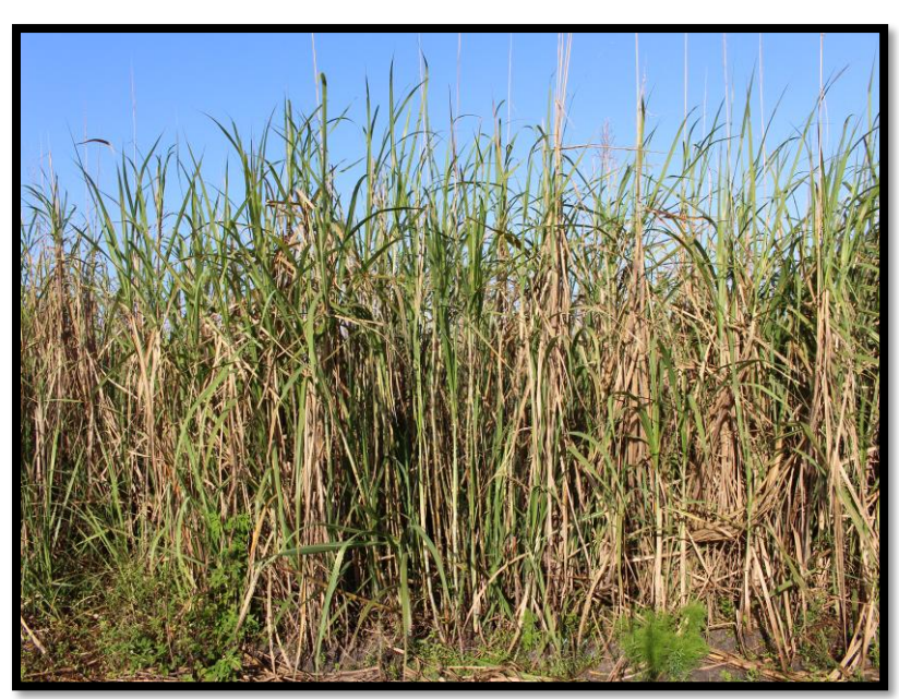
CP 06-2495 at late growth stage in sand soil